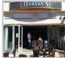
Stores & Restaurants