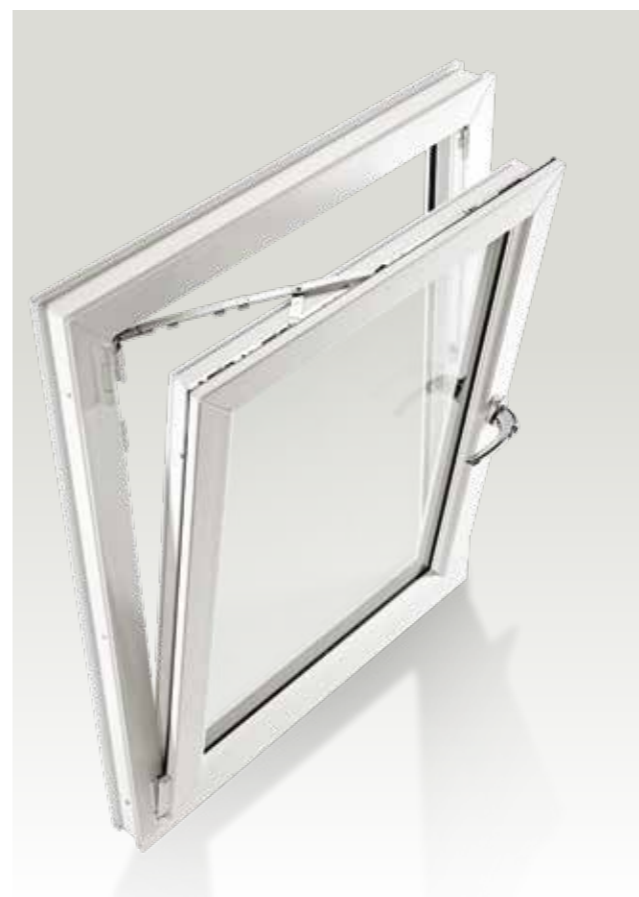
Tilt & Turn Windows